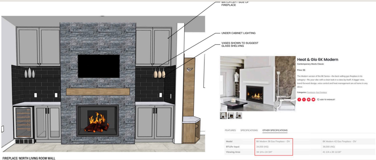
Example of a Design Rendering from a previous project